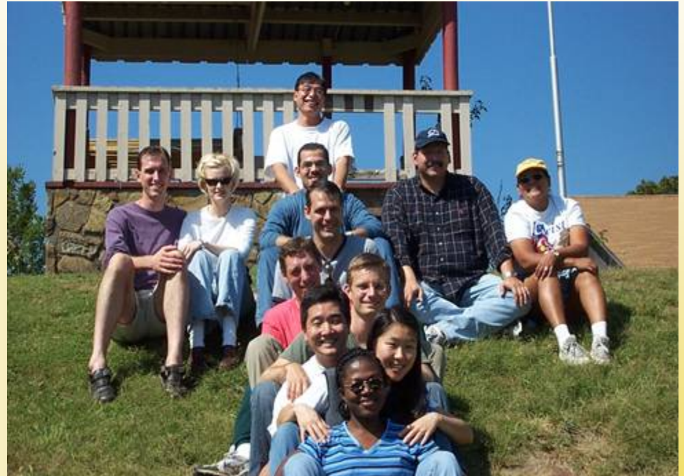
Residents At Personal Development Camp